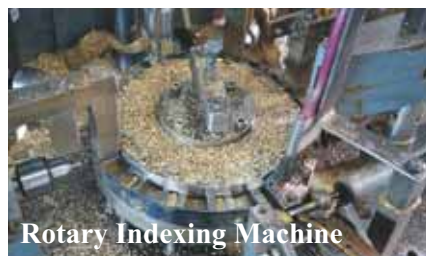
Rotary Indexing Machine

Balark has more than 450 different machines for production & tool room activities. Balark has dedicated & separate department for machine maintenance & other periodic maintenance. In addition to have a comprehensive manufacturing strength Balark also has separate department for design & development of new product.