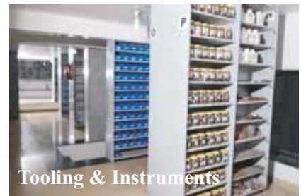
Tooling & Instruments

Balark has fully computerized system to control & monitor storage, handling, preservation and the flow of inward - outward material. The system makes sure the uninterrupted flow of all the required inputs like tools, equipments, men power & materials at every stage of process. The system blocks the further movement of uninspected material at each process.