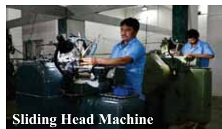
Sliding Head Machine