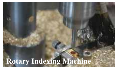
Rotary Indexing Machine