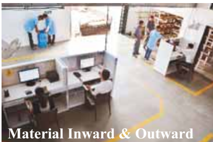
Material Inward & Outward